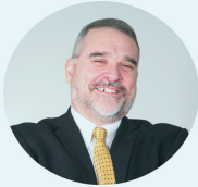
Jim Hamilton Finance

Our coaching staff has been in our members' position—the majority have owned and operated residential service companies, and the others are seasoned experts in their fields. We have someone who lives and breathes the information you're looking for, including the experts listed below.